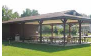
Sycamore Creek Park Hilltop Shelter 280 Hilltop Drive (Seats approx. 50)