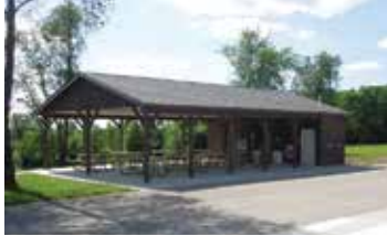
Simsbury Disc Golf Course Shelter 625 East Columbus Street (Seats approx. 50)