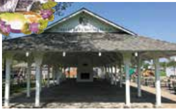
Victory Park Terry O'Brien Shelter 75 Lockville Road (Seats approx. 95)

$80 Fee $40 City Resident/Non-Profit Discount Fee *Fees are charged per time slot for each reserved space.