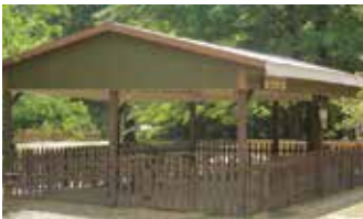
Sycamore Creek Park Moorhead Shelter 481 Hereford Drive (Seats approx. 50) (no electricity available)