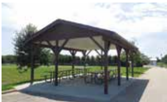
Diley Road Softball Fields Shelter 2 8995 Diley Road (Seats approx. 30)