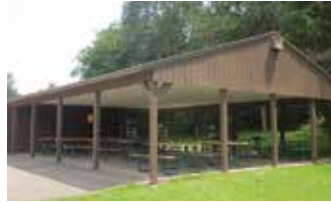
Sycamore Creek Park Pickering Shelter 300 Covered Bridge Lane (Seats approx. 80)