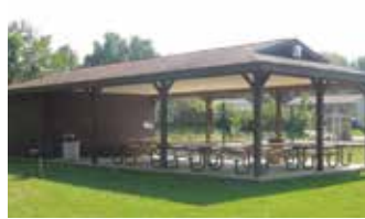
Sycamore Creek Park Hilltop Shelter 280 Hilltop Drive (Seats approx. 50)