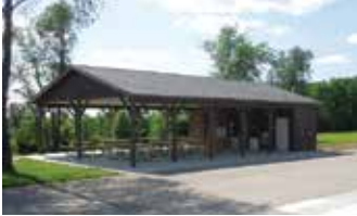
Simsbury Disc Golf Course Shelter 625 East Columbus Street (Seats approx. 50)