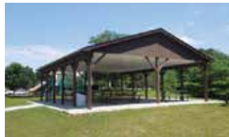
Willow Pond Park Shelter 209 Pruden Drive (Seats approx. 50)