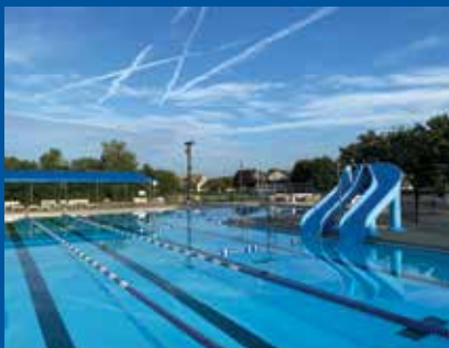
Pickerington Community Pool Information on page 2