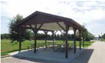
Diley Road Softball Fields Shelter 2 8995 Diley Road (Seats approx. 30)