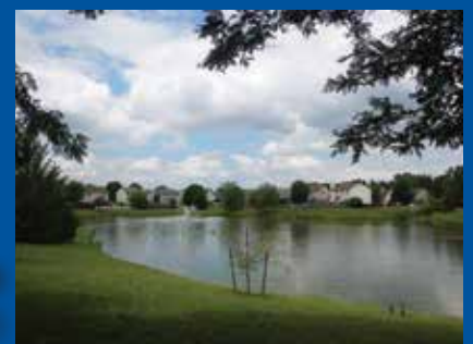
Park Facility Reservations Information on page 3