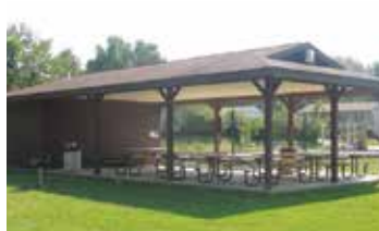
Sycamore Creek Park Hilltop Shelter 280 Hilltop Drive (Seats approx. 50)