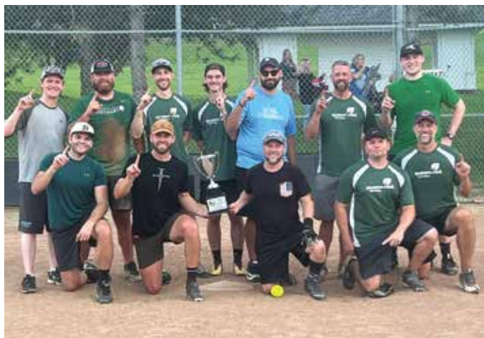
2022 Men's Church League Champions, Sycamore Creek Church

The department maintains a free agent list for individuals who would like to join a team. If there are enough free agents, a new team will be formed. If not, free agent's contact information will be distributed to team managers, however, placement on a team is not guaranteed. To be added as a free agent, call 614-833-2211 or sign-up online at www.pickerington.net .