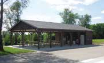
Simsbury Disc Golf Course Shelter 625 East Columbus Street (Seats approx. 50)