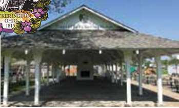
Victory Park Terry O'Brien Shelter 75 Lockville Road (Seats approx. 95)