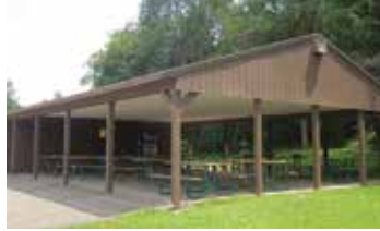
Sycamore Creek Park Pickering Shelter 300 Covered Bridge Lane (Seats approx. 80)