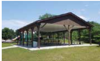
Willow Pond Shelter 209 Pruden Drive (Seats approx. 50) (Restrooms now available)