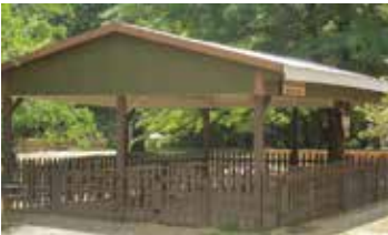
Sycamore Creek Park Moorhead Shelter 481 Hereford Drive (Seats approx. 50) (no electricity available)