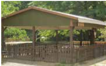
Sycamore Creek Park Moorhead Shelter 481 Hereford Drive (Seats approx. 50) (no electricity available)