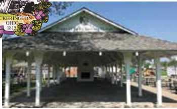
Victory Park Terry O'Brien Shelter 75 Lockville Road (Seats approx. 95)

$80 Fee $40 City Resident/Non-Profit Discount Fee *Fees are charged per time slot for each reserved space.