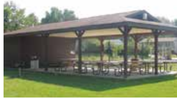
Sycamore Creek Park Hilltop Shelter 280 Hilltop Drive (Seats approx. 50)